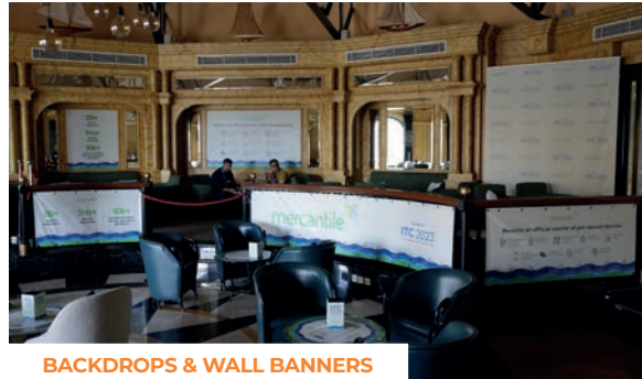
BACKDROPS & WALL BANNERS

Transform the room into a dedicated, fully branded presentation space to amplify your company's presence and visibility. With options to incorporate branded signage, display screens, and customised decor, the space becomes an immersive environment that reflects your identity and captures delegate attention. This tailored setup ensures your brand stands out, creating a lasting impact and reinforcing your position within the industry.