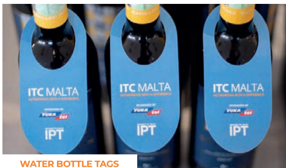
WATER BOTTLE TAGS